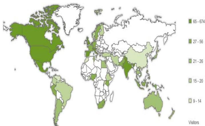
Table 2. Daily unique visitors in top 20 countries