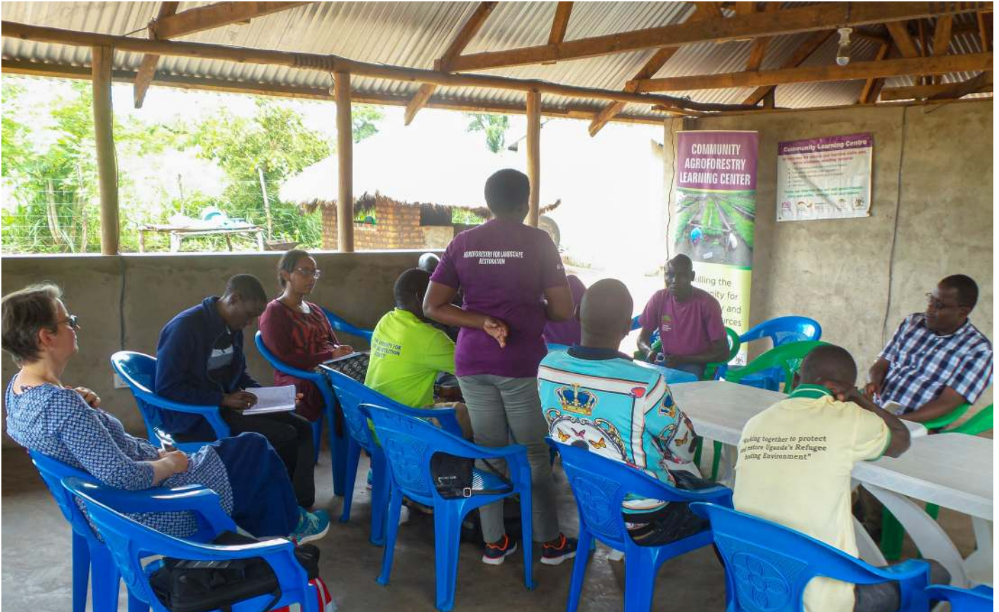
Project partners meeting at ICRAF agroforestry community learning center at Rhino camp refugee settlement in Uganda.