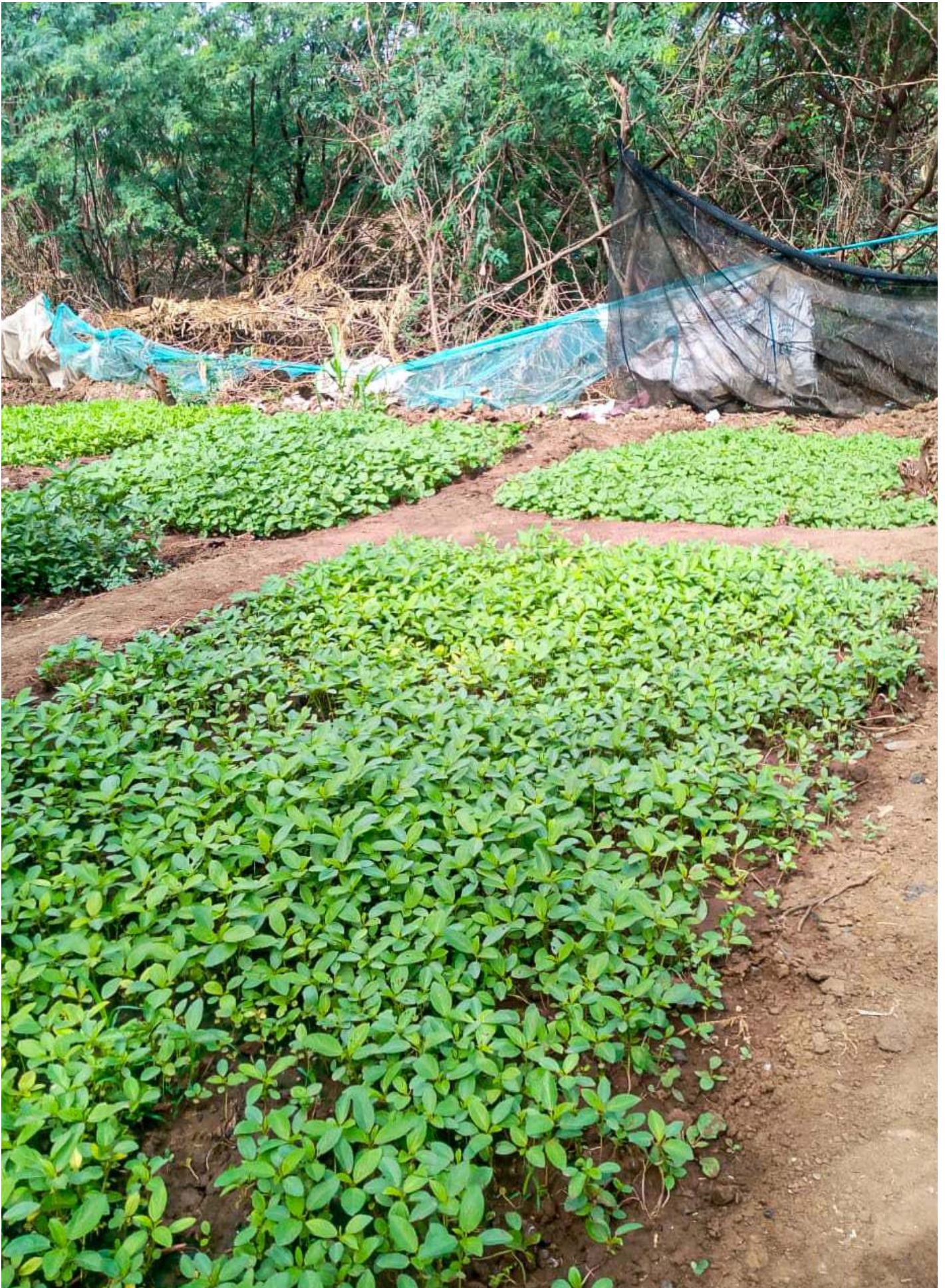
Gray water-irrigated home garden in Kakuma refugee camp, Kenya.