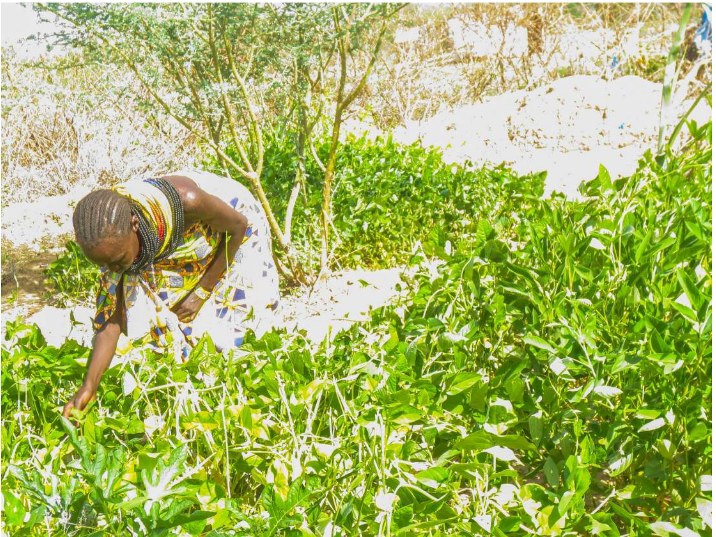
Gray water-irrigated home garden in Kakuma host community, Kenya.

In addition to these guidelines being observed in the RRR in refugee context work, it was also applied in response to increased environmental degradation and promotion of alternative energy sources in refugee hosting districts in Uganda. The project focuses on capacity development in action planning and programming in energy, environment, and climate change mitigation and adaptation, and enhancement of participation of women, girls and disadvantaged groups in a project conducted by Save the Children, CIFOR-ICRAF, Enabel, Joint Energy and Environment Projects (JEEP), and other partners with funding from the European Union Emergency Trust Fund for Africa (EUTF). 3 In this project, the authors of the strategy supported the project team in the development of a key informant tool administered to represent local government, private sector, community-based organizations and civil society organizations. One limitation observed in this project is that 80% of employees in local government were men, which meant that, in addition to interviewing women, female enumerators also interviewed male officers. It is an example where some planned procedures may need to be adapted to the local context, and in the questionnaire, the gender of both enumerator and respondent is indicated.