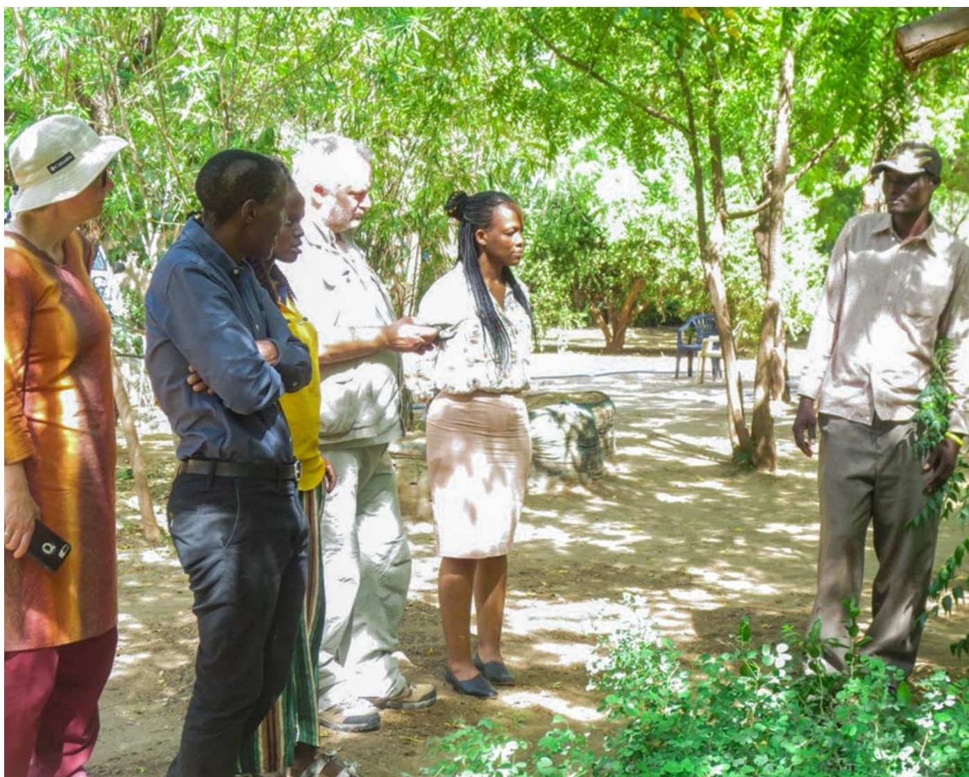
Project team in a discussion about fruit tree seedlings at the tree nursery managed by Lotus Kenya Action for Development Organization (LOKADO) and FAO at Kakuma, Kenya.