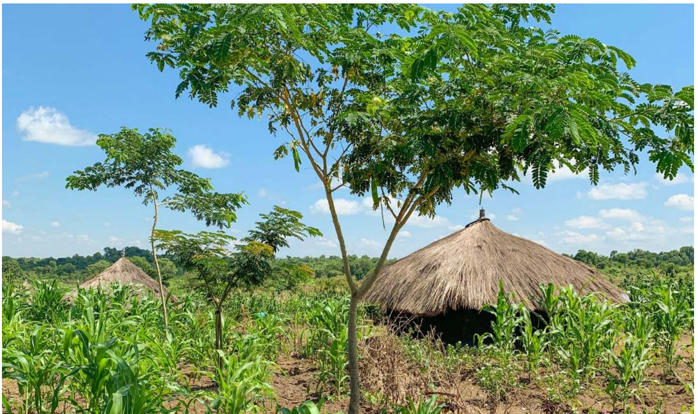
Refugee settlement in Rhino, Uganda (photo: ICRAF).

The United Nations High Commissioner for Refugees (UNHCR), the UN Refugee Agency, estimated that there were 89.3 million forcibly displaced people worldwide at the end of 2021. This included 25.7 million refugees, of which 6.9 million were hosted in the African continent (UNHCR 2022). The conflict in South Sudan has led to millions fleeing into Ethiopia, Kenya and Uganda. Other key groups of refugees include the Rohingya ethnic minority fleeing Myanmar and the continuing exodus from Syria, as well as those fleeing the war in Ukraine.