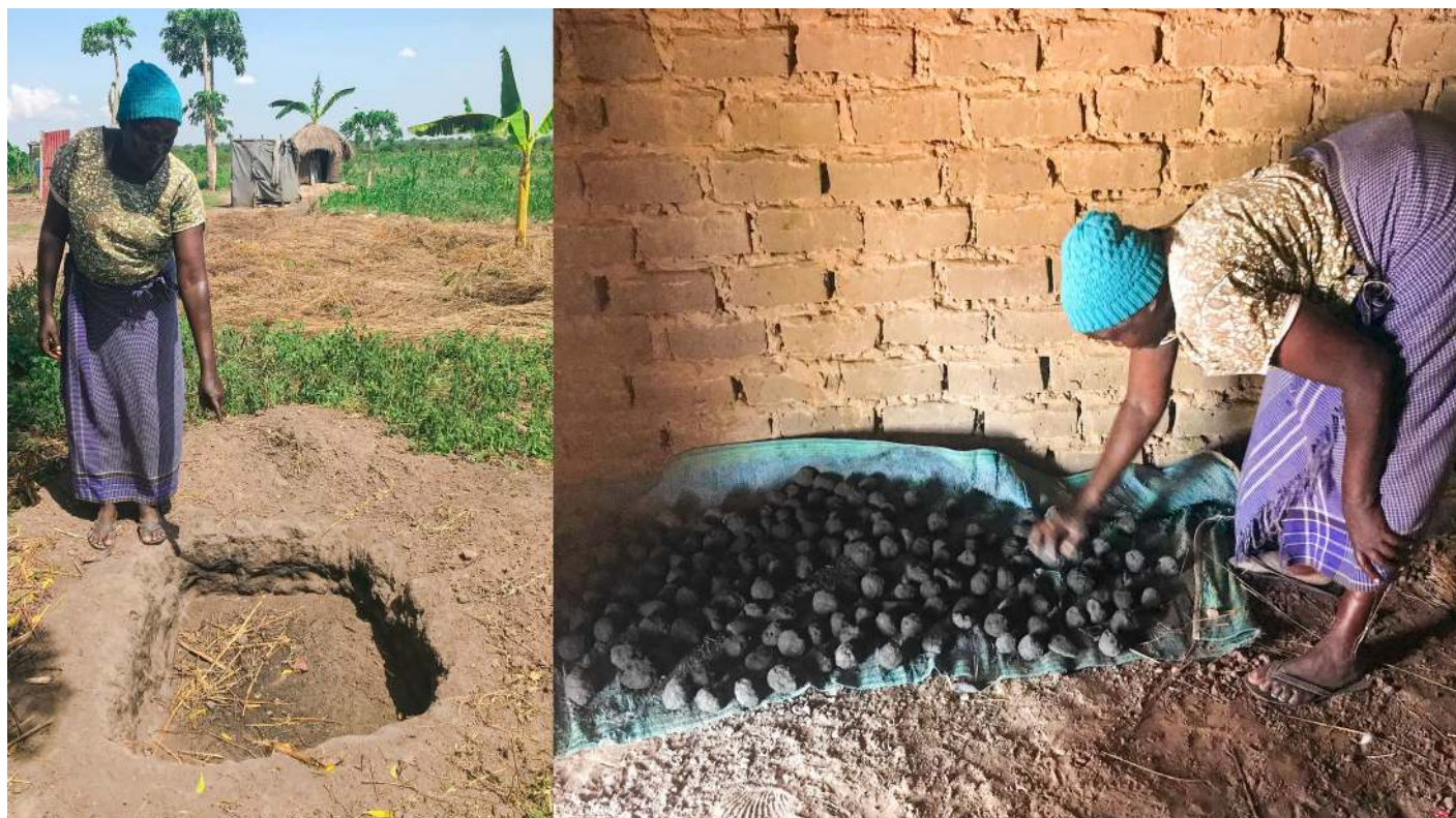
After receiving training from local trainers, this woman living in Rhino camp refugee settlement, Uganda, carbonizes crop residues in a pit and uses the char to produce fuel briquettes to meet her cooking needs.

GTA calls for all parties involved to reflect upon their intersectional social positions and how those assumptions may guide program creation and delivery. The act of reflection allows for a reasoned consideration of the adoption and integration of a given set of innovations or practices including the ability to observe unexpected responses. From the professional viewpoint, the iterative nature of gender transformative work allows for ongoing self-correcting feedback as projects are tweaked to suit the needs of recipients and the nature of those individuals and communities becomes clearer.