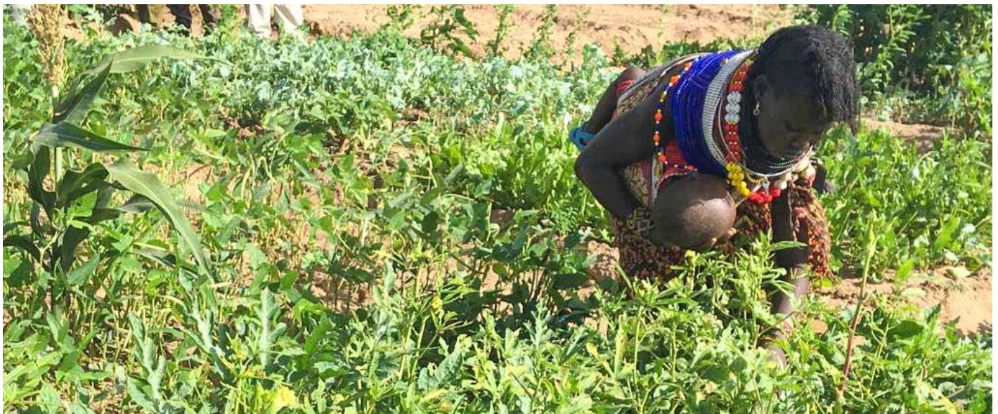
Gray water-irrigated home garden in Kakuma host community, Kenya (photo: World Agroforestry [ICRAF]).

To that end, it is important to understand some key terms: gender , intersectionality , and the dynamics of social change . Each of these concepts help to define applied gender integration and transformation in a targeted manner that improves the impact and outreach of research and development projects. The strategy was originally developed for application in the Resource Recovery and Reuse (RRR) in Refugee Settlements in Africa project. Its application was extended to other projects in a refugee context and beyond, as described later.